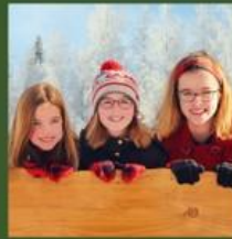
THE BROWN SISTERS