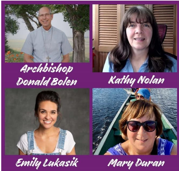
Archbishop Donald Bolen